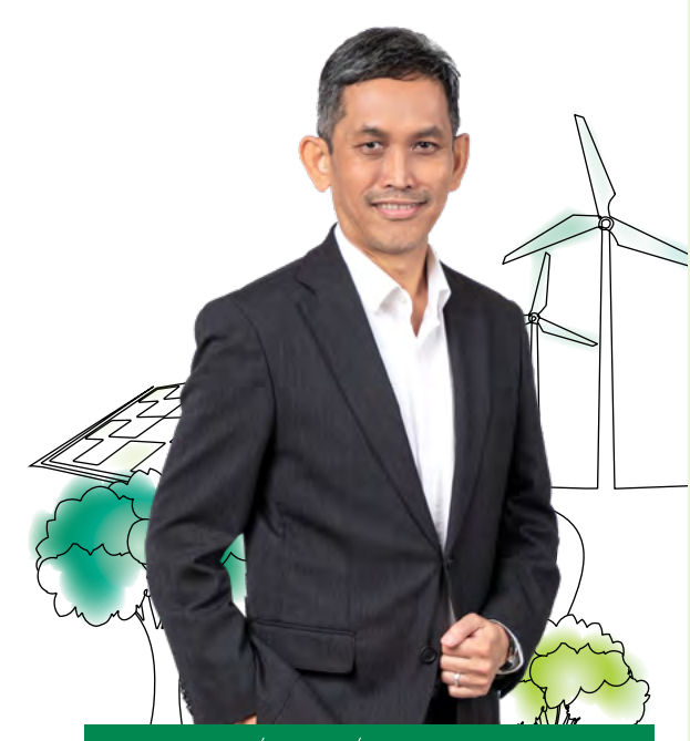
Malaysian / 54 / Male Date of Appointment: 1 July 2023

Managing Director, TNB Power Generation Sdn. Bhd.