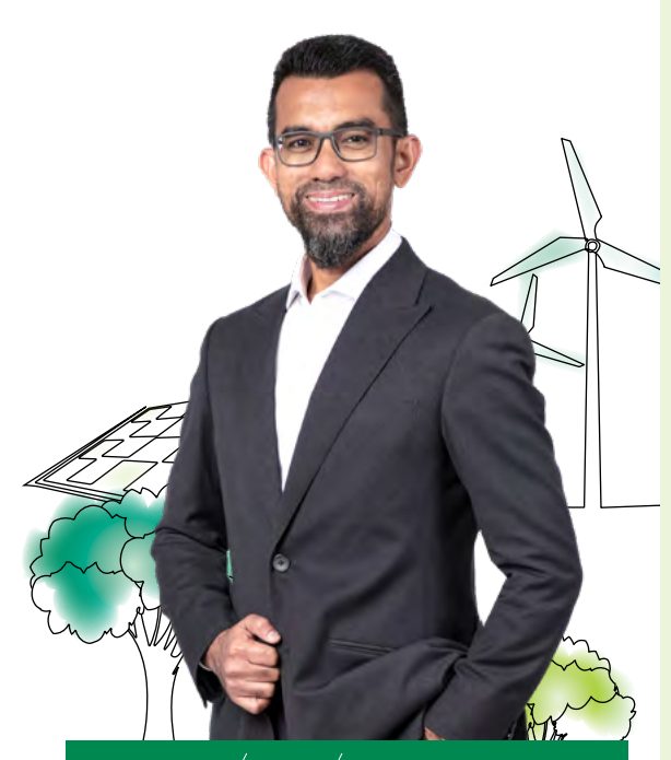
Malaysian / 48 / Male Date of Appointment: 1 March 2024